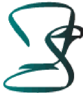
"Park Avenue" Effect>Stylize>Round Corners Gradient Fill