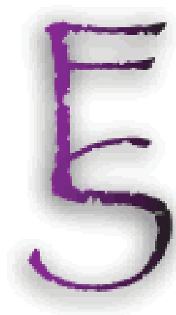
"Papyrus" Gradient Fill Shadow