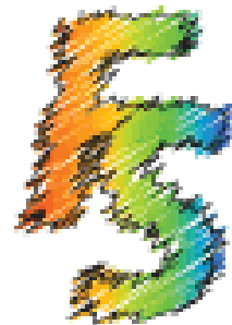
"Myriad" Gradient Effect>Stylize>Scribble Stroke in black